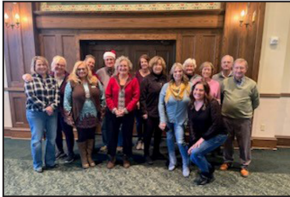
Group photo in front of the mantel