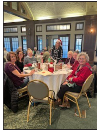
Getting into the festive spirit