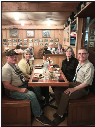
Enjoying a delicious meal