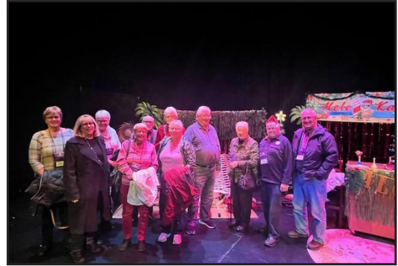
Group photo at the play