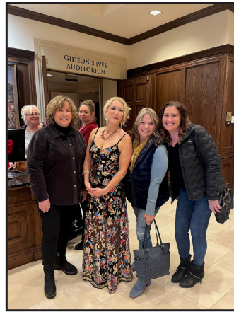
CorClub members with one of the singers