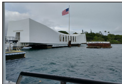
Pearl Harbor USS Arizona Memorial