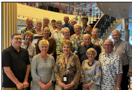
Group photo on the cruise ship