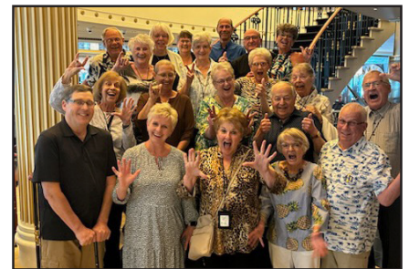
Fun group photo on the ship

We had a wonderful group of CorClub members set sail on a Hawaiian adventure in February. We began the journey in Honolulu for two days at the Outrigger Resort on Waikiki Beach. Travelers had time to explore the beach, go shopping, or just relax. We were able to spend some time of reflection at the Pearl Harbor Memorial before we boarded the Pride of America cruise ship. While on the cruise we enjoyed and explored the ports on the islands of Oahu, Maui, Hawaii, and Kauai. The travelers were kept very busy exploring the islands on excursions, going to a luau, whale watching, and hiking. Others took part in island tours by motor coach, glass bottom boats, helicopters, and even submarines! On board the ship we spent time relaxing in the sun and enjoying all the options of international cuisine and the nightly entertainment. Members enjoyed several meals together as a group and were able to get acquainted with each other and share stories of our adventures! We returned home with great memories and new friendships!