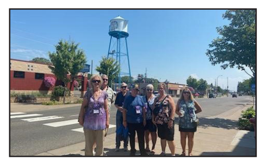
Group outside the Lindstrom water tower

Α E Z V G D D D X Z S К T 0 U R R U К T Υ U E Ν Ε C В C 0 R D Q Υ F T S Q S P T G 0 G M 0 R Υ D W Α Υ G C R R P D C Υ J C В X В Y A O J Υ D D D 0 U 0 A C 0 R C D Α J 0 M E D E S R C C E C U K N В Q R Q S P C Т Α ı D 0 N Y T 0 D E В E К C R 0 F E S Α T Y O X S U U В G 0 F G P N В D Υ D M Т Т В E M 0 0 E S 0 D Ε Ε G G M G Ν Y 0 S G Y P U N Н T J E R Y B Y E R E Z G В D К S S S S 0 E C B C Υ U R P Ε E C U P X Н Н Т Z C E Υ D Н Z R В Q Α U P В P Н ٧ ٧ ı В G Ν C C E E G 0 R C U В D S W Н E U Н К G Y M Y S S T C S W M C К E В R C T Н D C C C Z T C D S S Ε Ε Ε Ε K R D Q D Q E C S R C S E G R Т T R 0 R W S C C V E S E T W E P S S N C E R L S M S T S E J S P W E P Υ W W Α B E К Q Υ G 0 Q U W U Q R 0 D N В К L Z S D G S D U X U C P T M R S В D K T P Y A Q T X T A M N L J E Z X 0 C T R 0