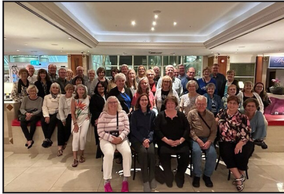
Group photo for the cruise