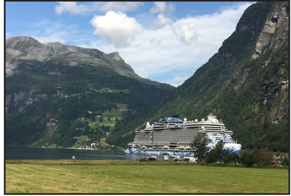
Norwegian Prima ported in Geiranger, Norway