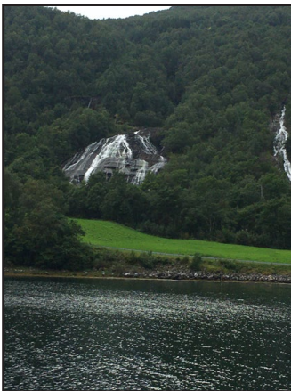
Beautiful waterfalls in Norway