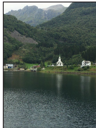
Fjords in Geiranger, Norway