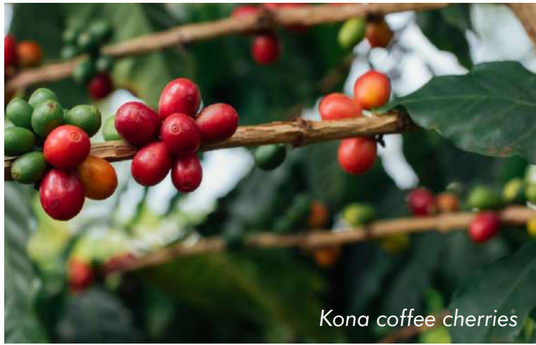
Kona coffee cherries