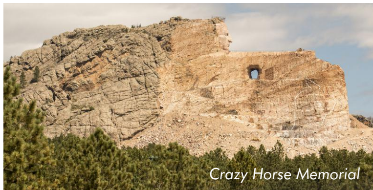
Crazy Horse Memorial

After breakfast we'll depart on the remainder of our journey home with stops for comfort and lunch on your own along the way.