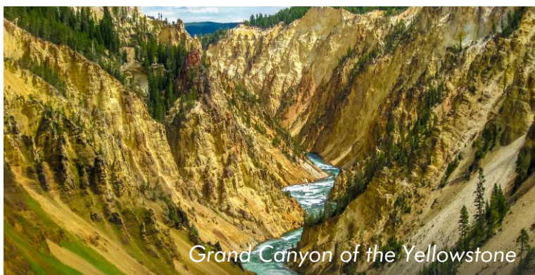
Grand Canyon of the Yellowstone