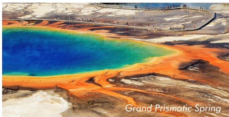
Grand Prismatic Spring