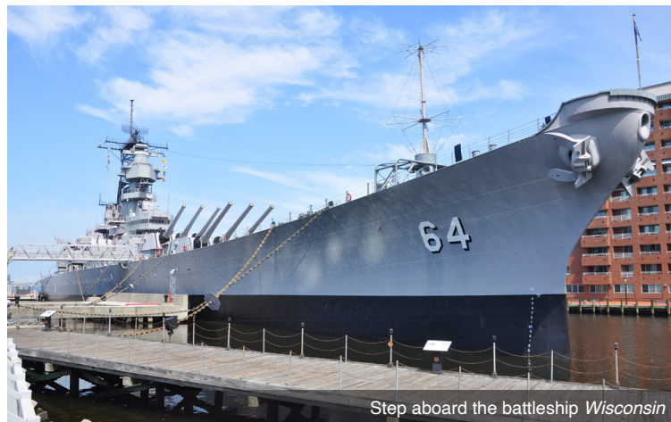
Step aboard the battleship Wisconsin

Numerous food trucks will be available for you to have lunch. Then, explore the history and significance of Fort Monroe, a National Historic Landmark, whose history spans 400 years. Later, visit the Virginia Air and Space Center whose permanent collection spans 100 years of flight, featured over 30 historic aircraft and the Apollo 12 Command Module. Meals: B, D