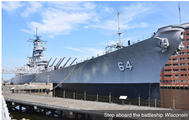
Step aboard the battleship Wisconsin

Numerous food trucks will be available for you to have lunch. Then, explore the history and significance of Fort Monroe, a National Historic Landmark, whose history spans 400 years. Later, visit the Virginia Air and Space Center whose permanent collection spans 100 years of flight, featured over 30 historic aircraft and the Apollo 12 Command Module. Meals: B, D